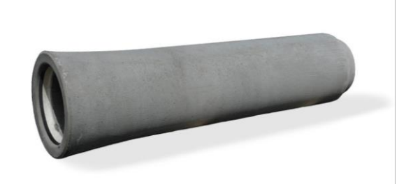
Figure 1. Picture of a KANMAX PG® concrete pipe.